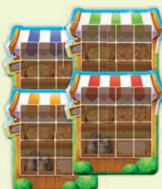
4 Farm Shop Boards (in 4 colors)