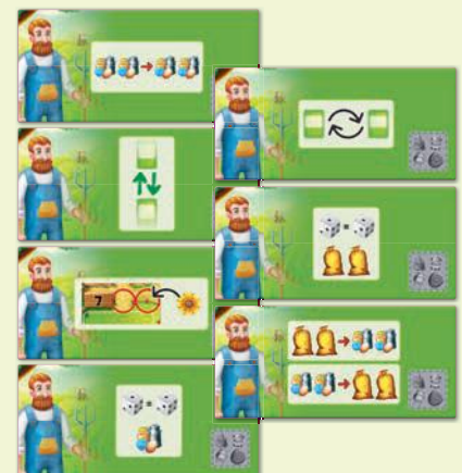
7 Farmer Skill Tiles