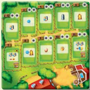
4 Farm Player Boards (2-sided)