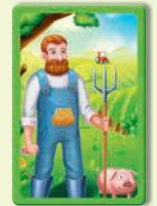
1 Farmer Card