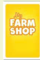
10 Jump-Start Cards