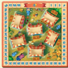
1 Market Board