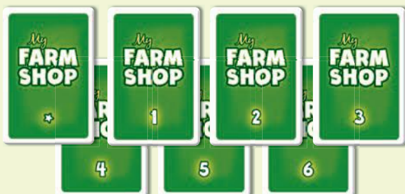
59 Field Cards (with different backs)