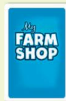
6 Goal Cards