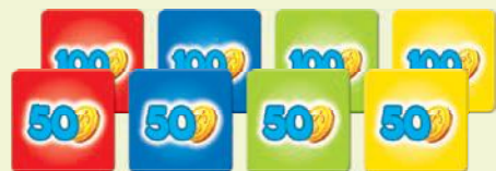
4 50/100 Coins Tiles (in 4 colors)