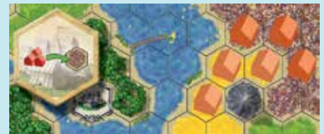
The player builds 3 additional settlements on the flower field spaces after her mandatory action.

Note: If these 3 additional settlements are built on water or mountain spaces, they do not count for gold for the Kingdom Builder cards “Fishermen” and “Miners”.