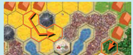
The player moves one of her settlements 3 spaces, then claims the nomad tile next to its new location. Then she moves another settlement 1 space next to a location space.

You may perform this extra action either before or after your mandatory action.