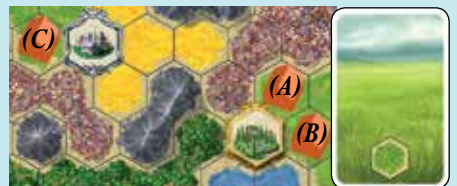
The player builds settlements A and B next to a location space on the appropriate terrain, then uses the outpost to build settlement C next to a nomad space.

This settlement must still be built on the appropriate terrain type for your mandatory action or the specific extra action.